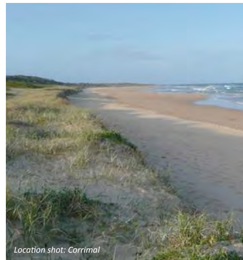
Location shot: Corrimal

Surf Lifesavers successfully resuscitated a thirty year old male after he and two others were rescued near the rocks at Corrimal Beach north of Wollongong on New Year 's Day. In a separate incident Surf Lifesavers were kept busy at Copacabana where a young female surfer was dragged to the beach unconscious by her friends and resuscitated by Surf Lifesavers. This was an outstanding effort by all involved.